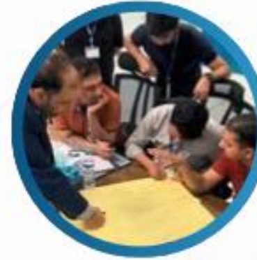
Real world Scenarios / Case studies